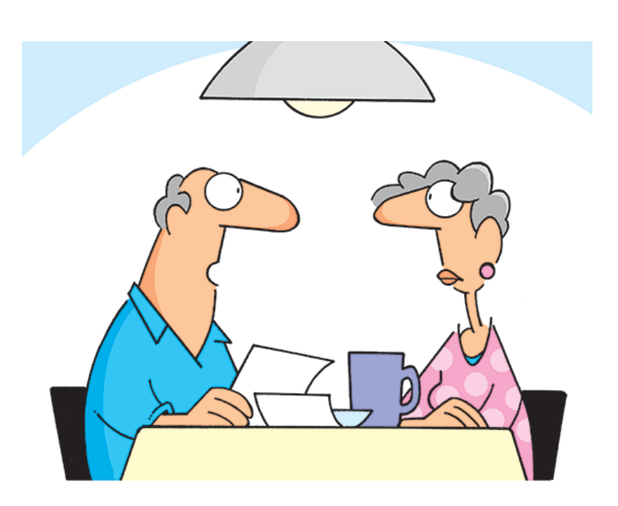
"I finally put something aside for my retirement. I put aside my plans to retire."